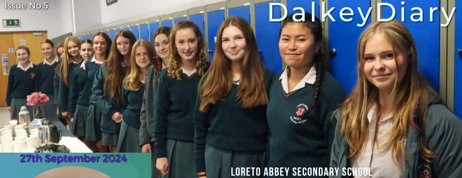
LORETO ABBEY SECONDARY SCHOOL