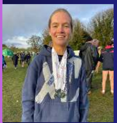
Cross Country Running